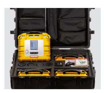
Grab and go.

Keep the rapid deployment kit on your first responders' truck. So when they're ready to go, their area monitors will be too.