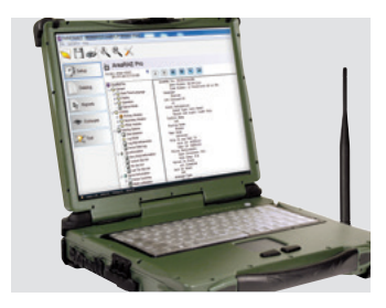
PC-BASED SOFTWARE FOR EASY CONFIGURATION

AreaRAE Plus has a 108-decibel alarm for local annunciation, so when it goes off, you'll hear it — even in noisy environments. It also has wraparound LEDs for maximum visibility, even in sunlight. Plus 3 relays for connection to external strobes, horns or other triggers.