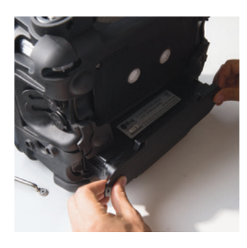
FLEXIBLE POWER FOR SHORT- AND LONG-TERM DEPLOYMENTS

AreaRAE Pro has a 108-decibel alarm for local annunciation, so when it goes off, you'll hear it — even in noisy environments. It also has wraparound LEDs for maximum visibility, even in sunlight. Plus 3 relays for connection to external strobes, horns or other triggers.