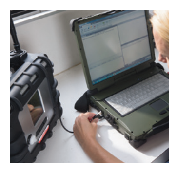
PC-BASED SOFTWARE FOR EASY CONFIGURATION

AreaRAE Pro's rechargeable lithium-ion battery delivers 20 hours of runtime, and you can use the real-time monitoring software to keep an eye on the battery life of each detector. Battery running low? Simply switch it out or, as another option, replace it with a rechargeable battery. For around-theclock deployments, use the AreaRAE Pro with A/C power or with our SolarRAE, an all-weather, solar-powered enclosure with hazmat gloves.