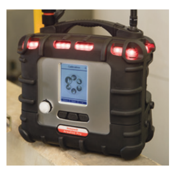
A MONITOR THAT'S EASY TO HEAR AND SEE

Despite its sophisticated capabilities, AreaRAE Pro is easy to operate — no Ph.D. required — and is available in multiple languages. Just turn it on and go. It also has big buttons that are easy to use with hazmat gloves.