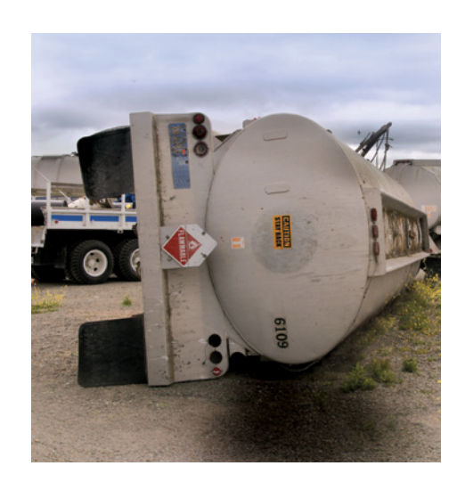
ProRAE Guardian helps incident command establish a perimeter, track and identify the real-time concentration of toxic chemicals, combustible materials, radiation, and plumes to protect responders and the community.