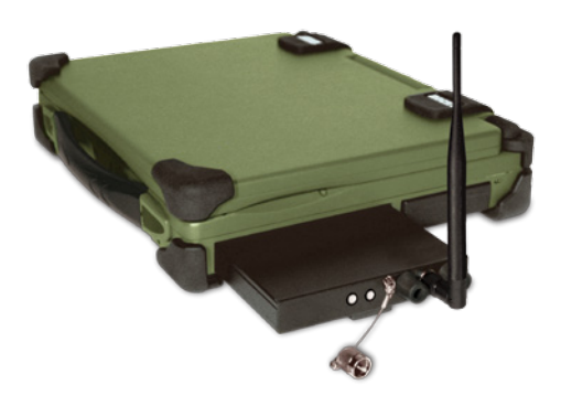
RDK Ruggedized Host with integrated RAELink modem device bay