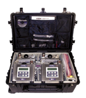
RDK Detector Kit