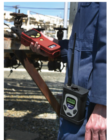
UltraRAE 3000 with RAELink3 used for screening potentially hazardous leaks